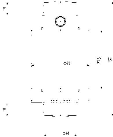
Technical drawing in mm.