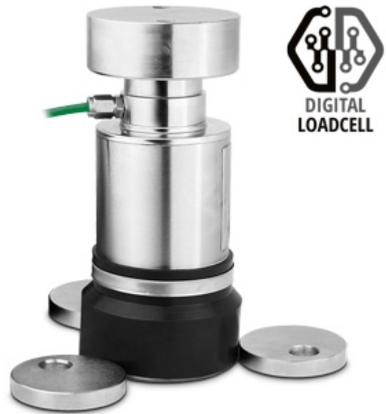
Assembly kit for RCPTDx0C3NC cells.